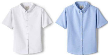
long or short sleeve traditional collar with or without collar buttons