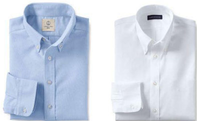
long or short sleeve traditional collar with or without collar buttons