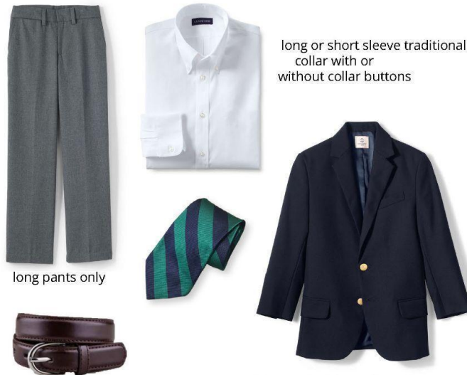
long or short sleeve traditional collar with or without collar buttons