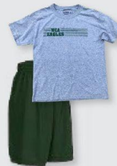
only ordered through schoolbelles or Land's End