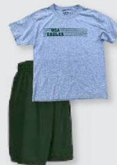
only ordered through schoolbelles or Land's End