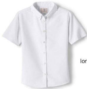
long or short sleeve traditional collar with or without collar buttons